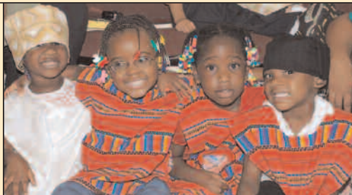
Children at MLK CCG Center celebrate Juneteenth