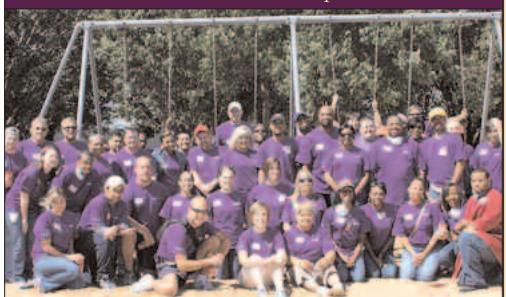
FedEx employees give a Day of Caring to make repairs to a playground at one of CCG's Centers