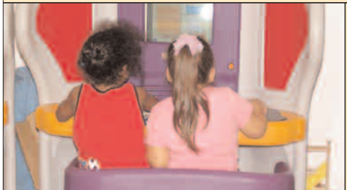
IBM's KidSmart program provides access to Young Explorer computer learning centers for children at CCG's child development centers