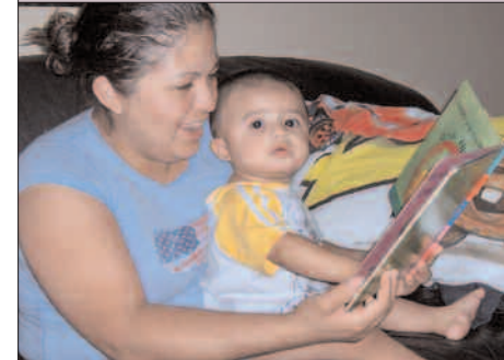
CCG's Born Learning, an early childhood initiative, provides education and training to parents to ensure their children age four and under are better prepared for learning and future school success

☞ Children at ChildCareGroup Gene and Jerry Jones Salvation Army Child Development Center received pajamas and new books as part of the 2008 Books at Bedtime Campaign sponsored by First Book-Dallas.