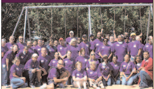
FedEx employees give a Day of Caring to make repairs to a playground at one of CCG's Centers