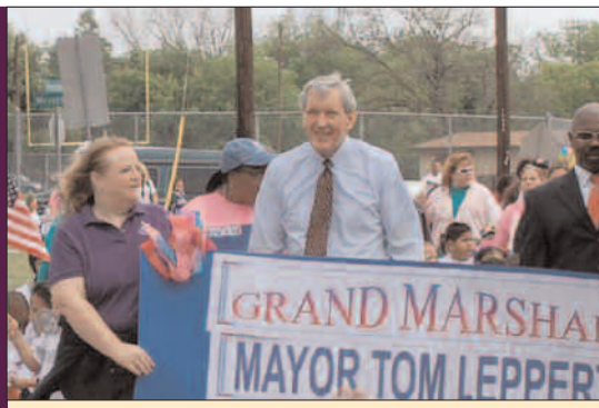
Mayor Tom Leppert served as honorary Grand Marshal for ChildCareGroup's annual Week of the Young Child Parade down MLK Boulevard in celebration of the National Week of the Young Child

ChildCareGroup sustains strong fiscal management and proactive fundraising efforts in order to serve the increasing number of children in need.