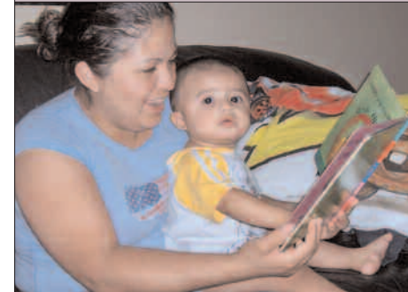
CCG's Born Learning, an early childhood initiative, provides education and training to parents to ensure their children age four and under are better prepared for learning and future school success