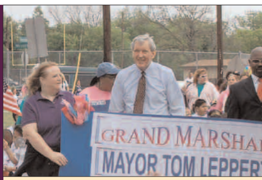
Mayor Tom Leppert served as honorary Grand Marshal for ChildCareGroup's annual Week of the Young Child Parade down MLK Boulevard in celebration of the National Week of the Young Child

ChildCareGroup sustains strong fiscal management and proactive fundraising efforts in order to serve the increasing number of children in need.