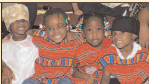
Children at MLK CCG Center celebrate Juneteenth