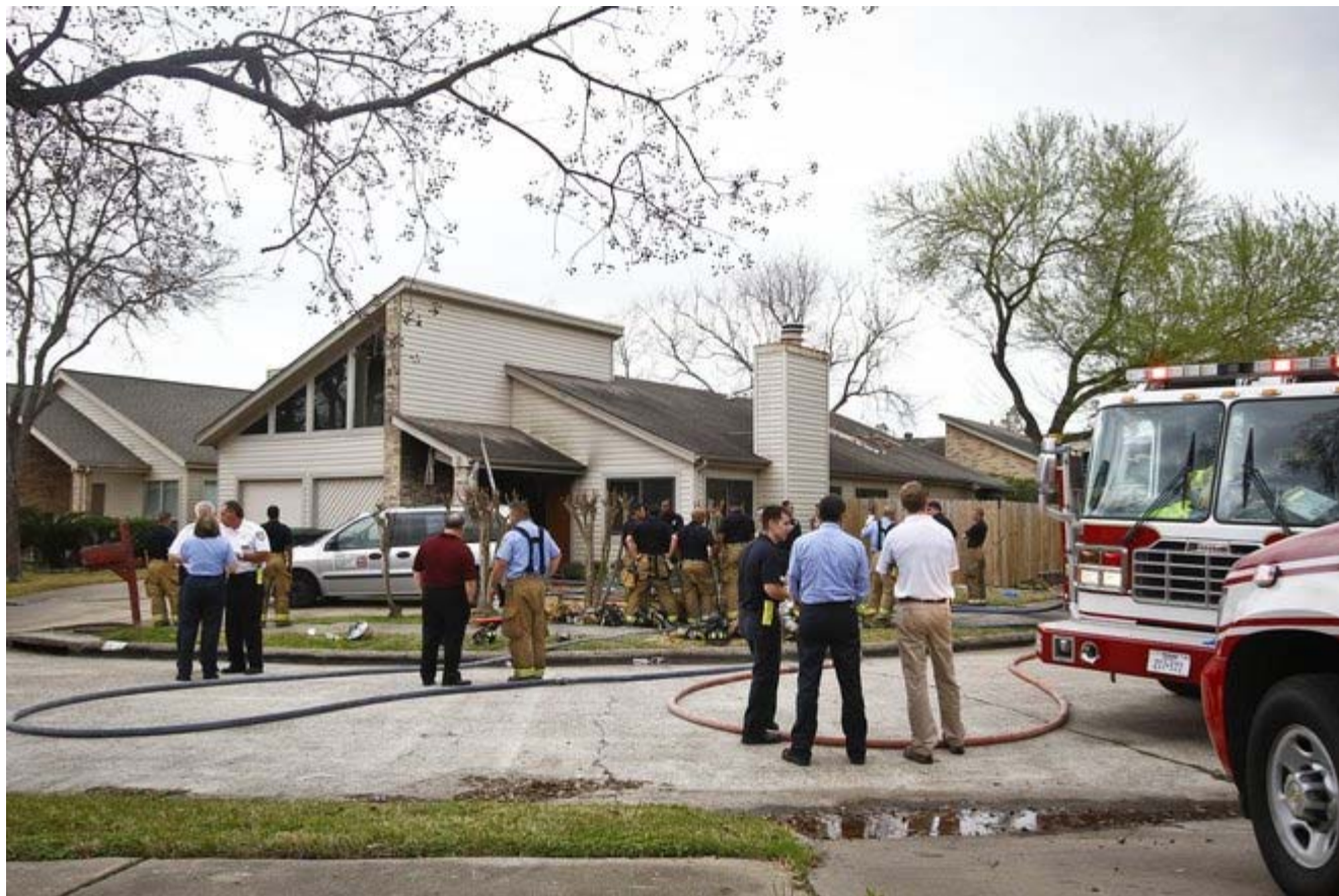
Emergency personnel respond to a 2011 day care fire that killed four children in Houston. MICHAEL PAULSEN/Houston Chronicle/AP File

Copyright © 2012, World Publishing Co. All rights reserved